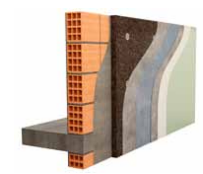
External walls: ETICS/ EIFS