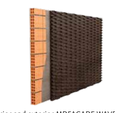
Interior and exterior MDFACADE WAVE