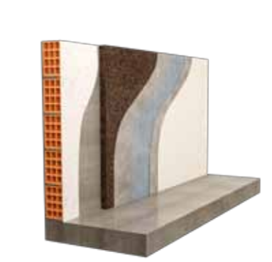
External walls: Interior Insulation