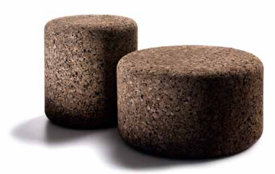
Mooi Cork Stools, by Jasper Morrison