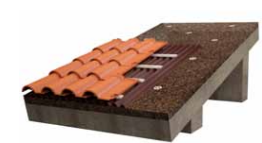
Roofs: Pitched roof with corrugated roofing system