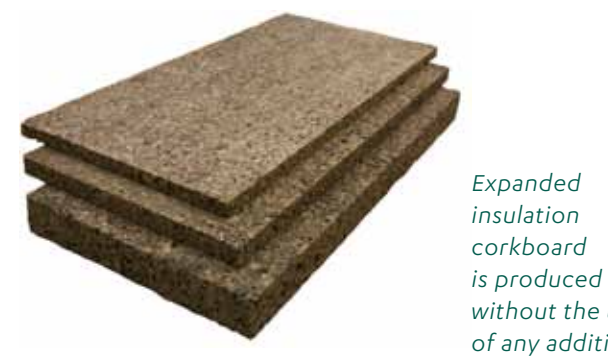
without the use of any additives