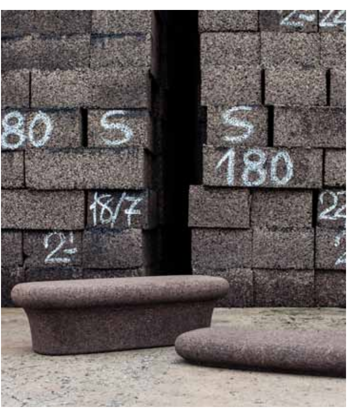
Cork Benches, by Naoto Fukasawa